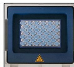
Shown with 0.5ml tubes