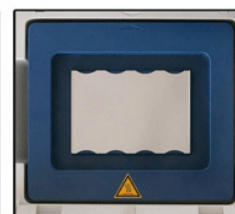
Shown with in-situ adapter

Benchmark Scientific, Inc. PO Box 709 Edison, NJ 08818 PH: 908.769.5555 - FAX: 908.222.1864 - EM: info@BenchmarkScientific.com