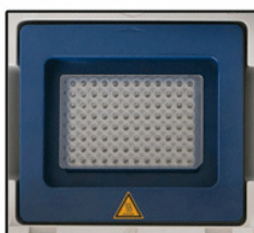
Shown with 96 well plate