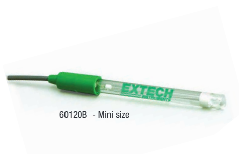
60120B - Mini size