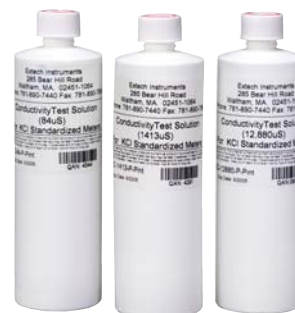
EC-84-P, EC-1413-P, and EC-12880-P pint size conductivity standards