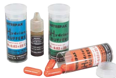
650470 pH4, 7, and 10 buffer capsules with color key preservative