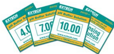
PH103 includes 6 pouches each of pH4, pH7, and pH10 Buffers plus 2 Rinse solutions