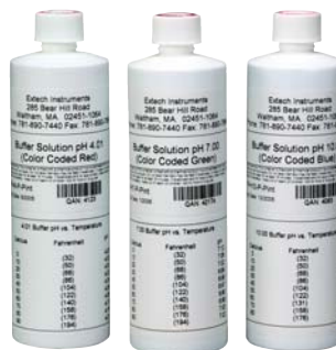
Pint size pH buffers for pH4, 7, and 10 available (PH4-P, PH7-P, PH10-P)