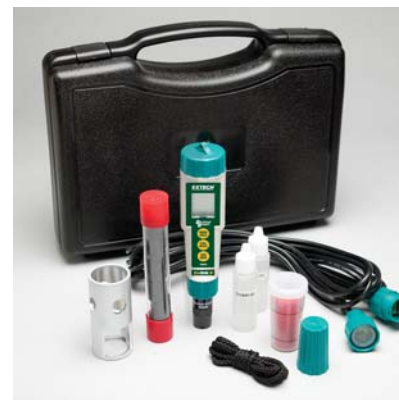
DO600-K — Kit includes DO600 meter, DO603 membrane kit, 16ft (5m) extension cable, weighted probe guard, and hard carrying case — $125 savings