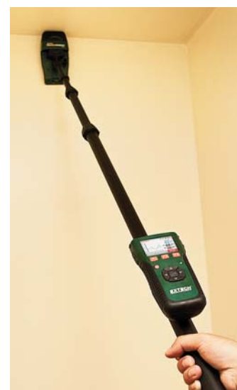
Wireless sensor affixes to telescoping handle