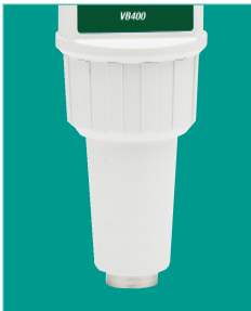
Magnetic base included