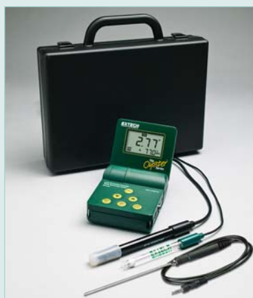
341350A-P kit comes with polymer Conductivity cell, glass pH electrode and Thermistor probe