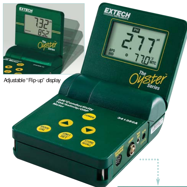
Adjustable “Flip-up” display