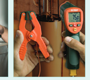
TP200 Type K clamp probe provides hands-free secure grip when measuring temperature on pipes up to 1.5" (38mm) diameter