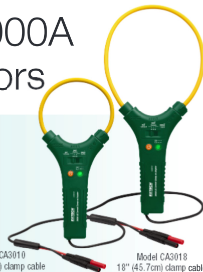
Model CA3010 10" (25.4cm) clamp cable

Expand your meter's capabilities to measure AC Current up to 3000A. Fit most MultiMeters or Clamp Meters with standard shrouded banana plug sockets. Flexible clamp jaw easily wraps around bus bars and cable bundles where standard clamp adaptors and meters can't. The thin 7.5mm cable diameter easily fits into tight spaces. Choose between a 10" (25.4cm) or 18" (45.7cm) clamp cable length.