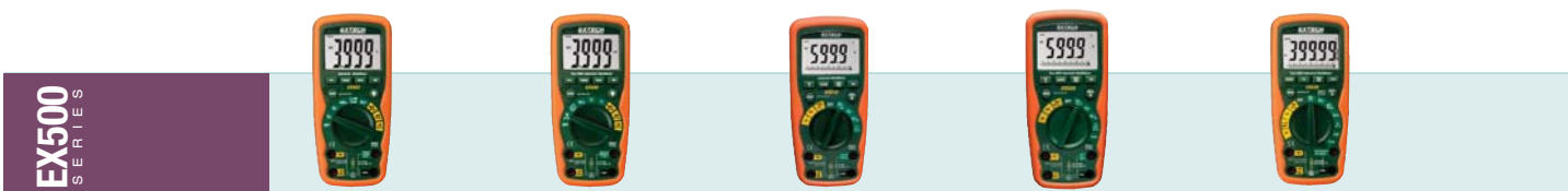
Drop-proof to 6 feet (2.9m)