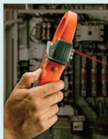
Built-in IR Thermometer with laser pointer is an excellent troubleshooter for locating hot spots and overheating motors.