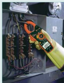
CAT IV -600V safety rating for added protection and True RMS feature gives you accurate readings of non-sinusoidal waveforms.