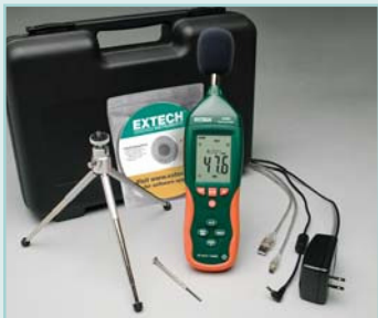
Meter and accessories are packaged in a rugged hard carrying case for added protection