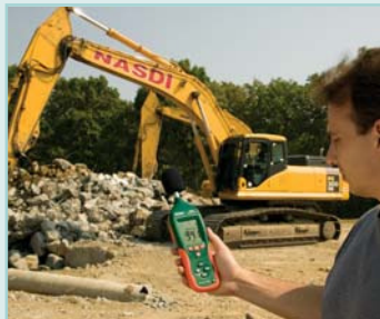
Meets new IEC 61672-1 Class 2 accuracy standard for OSHA and other local and national noise ordinances