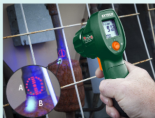
A. Distance-to-Spot coaxial guidance laser B. UV detection of refrigerant leak

Professional 4-in-1 Thermometer features a non-contact Infrared Thermometer, UV Leak Detector, bright Flashlight, and a unique coaxial Distance-to-Spot guidance laser. This combination meter helps you take quick temperature readings on unsafe surfaces while the circular laser shows you the area being measured to maintain accurate measurement distance. Its UV light easily reveals refrigerant leaks in combination with a standard UV dye (not included) on AC units, pipes, and automobiles. Convenient built-in bright flashlight will help you do your job in dark environment.