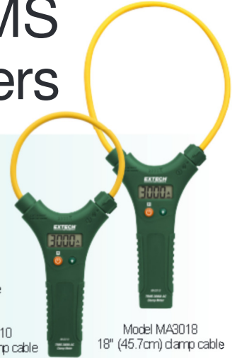
Model MA3010 10" (25.4cm) clamp cable

Flexible clamp jaw easily wraps around bus bars and cable bundles that may be difficult to access with regular clamp meters. The thin 7.5mm cable diameter easily fits into tight spaces. Choose between a 10" (25.4cm) or 18" (45.7cm) cable clamp length to accommodate your application needs.