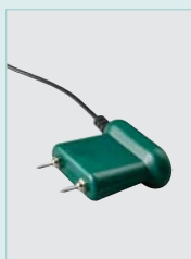
MO290-P Moisture Pin Probe