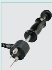
MO290-HP Moisture Hammer Probe