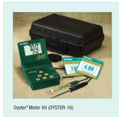
Oyster® Meter Kit (OYSTER-16)