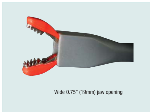
Wide 0.75" (19mm) jaw opening